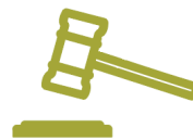
REFORM MANDATORY MINIMUMS