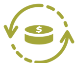
REINVEST IN COMMUNITIES