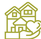
HOUSING AND HEALTHCARE